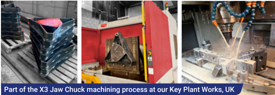
Part of the X3 Jaw Chuck machining process at our Key Plant Works, UK